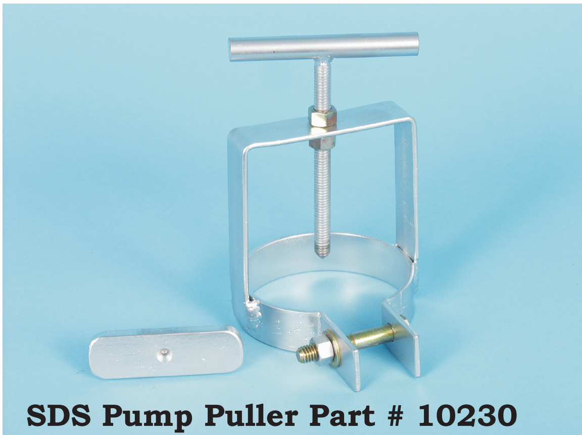
SDS Pump Puller Part # 10230