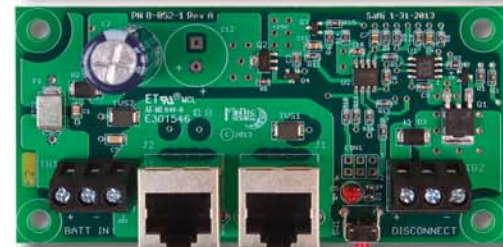
Battery Disconnect Module (MNBDM)