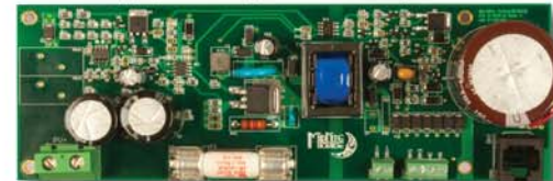
Power Supply Board (MNDiscoPSB)

SMA requested that MidNite Solar design and build Combiners that will be compatible with their TL series inverters. These DLTL combiners preserve SMA's unique emergency power back up feature during grid failure. The MNPVHV8-DLTL-3R, MNPVHV8-DLTL-4X and MNPVHV16-DLTL-4X are specifically designed for the new dual channel MPPT transformer-less inverters with an AC outlet that can be powered during a utility outage. The two MNPVHV8 DLTLs have four strings entering the combiner with 2 separate strings out while the MNPVHV16 has eight strings entering and two strings out.