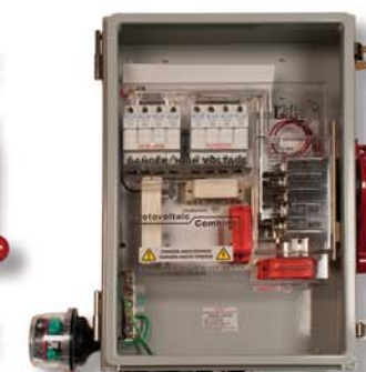
MNPVHV8 3R not shown