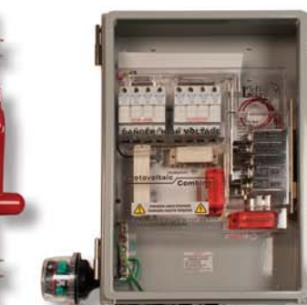
MNPVHV8 3R not shown