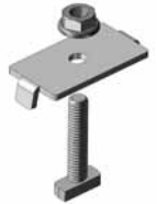
Mid Clamp w/RAD Bolt