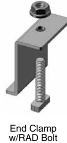
End Clamp w/RAD Bolt

Note: Replace with module depth from the Solar Module Specification Sheet. Example: EC-46-RAD end clamp for Sharp NU-U240F1 modules