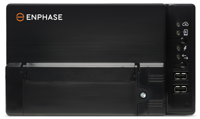
ENV-IQ-AM1-240 ENV2-IQ-AM1-240 (IEEE 1547:2018)

With integrated production metering and optional consumption monitoring, the IQ Gateway is the platform for total energy management. It integrates with the Enphase Energy System and IQ Battery.