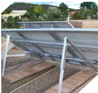
Underside of ballasted roof mount