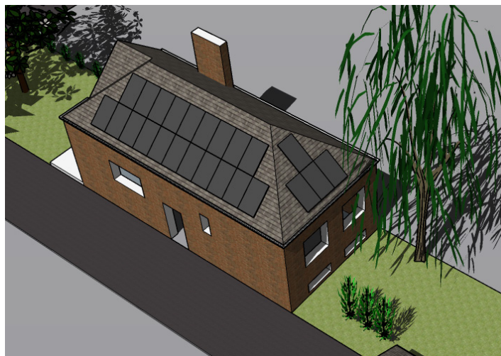
Figure 4: Shading pattern at noon. Entire array illuminated.