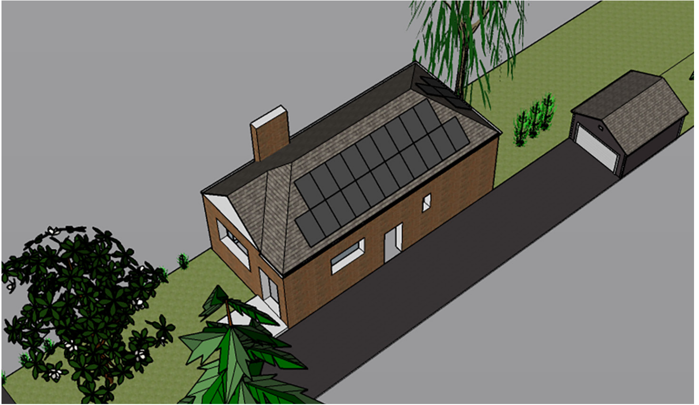
Figure 2: Residential bungalow in Toronto, Canada

Consider a one-story bungalow dwelling located in Toronto, Ontario. The house features hip roof design and multiple tall-standing trees in close proximity. The house owner faces multiple questions in creating a cost-effective PV system to meet all local codes and requirements. He wants the solar array to enhance the value of his property and deliver continuous revenue stream. His dilemma can be reduced to a number of key considerations: