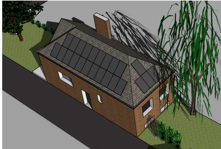
Figure 3: Shading pattern at 9AM. Small array partially shaded.