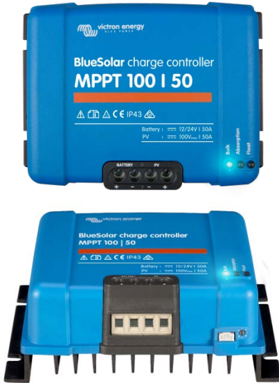
Solar Charge Controller MPPT 100/50