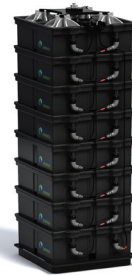
S-Line Battery Stack

See the Installation & Operation Manual.