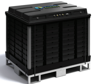
M-Line Battery Module