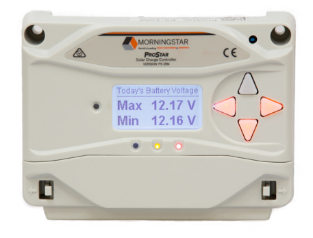
New ProStar (Gen3) shown with optional meter

The ProStar solar charge controller has been the leading mid-range pulse width modulation (PWM) controller since 1995. With over 350,000 units installed in the harshest environments in over 100 countries, the ProStar has developed a strong reputation for reliable performance. This third generation ProStar maintains the same quality and form factor as previous models, while offering new data, lighting control, graphical interface, and protection features to better meet the needs of off-grid solar applications.