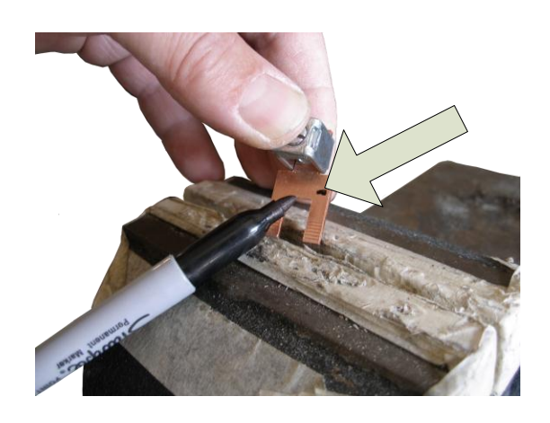
Step 2: Mark approximately as shown