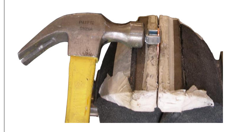
Step 4: Gentle encouragement. A few light taps should be sufficient.