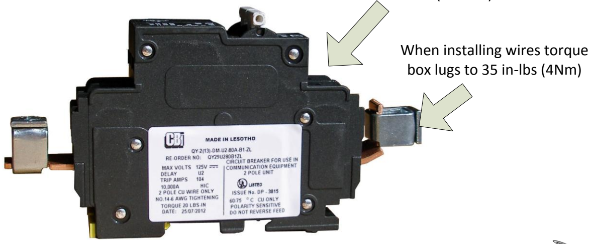
Step 6: Replace lug in breaker and torque to 20 in-lbs.

Torque circuit breaker connections to 20 in-lbs. (2.3 Nm)