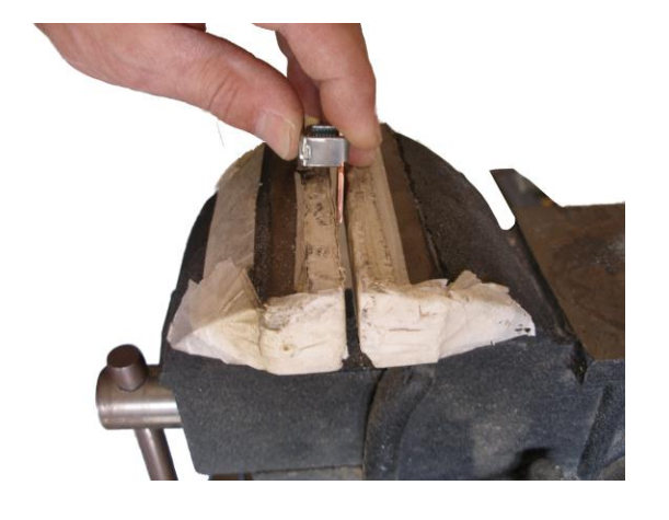
Step 3: Place in vice up to marking (Step 2)