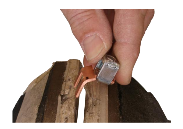
Step 5: Remove from vice.